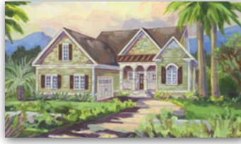
Balboa Island II

One of the two distinct elevations in the Balboa Island Series