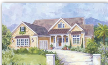
Balboa Island I

With its numerous front porches, flower and vegetable gardens, and shingle or siding exteriors, Balboa Island, California, seems to represent the quintessential seaside community. Like many beach towns on the Atlantic coast, Balboa Island was once a summer home destination that has matured into a year-round residential community. House styles reflect summer's easy living and classic cottage architecture, but have fully updated interiors. These plans are their Carolina cousins.