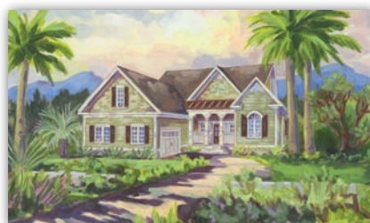
Balboa Island II

KENT select A SMARTER WAY TO A LUXURY HOME