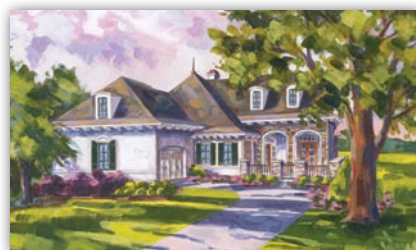
Hall Park II

KENT select A SMARTER WAY TO A LUXURY HOME