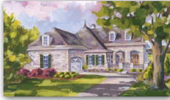
Hall Park I

Two distinct home styles in our European Collection