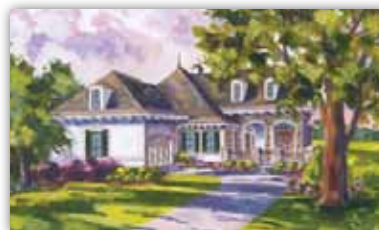
Hall Park II