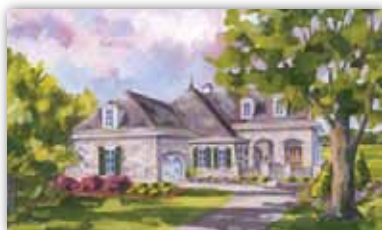
Hall Park I

England is known for elegant gardens, and the courtyard entry of this plan, while optional, makes a statement straightaway. The Hall Park Hotel, in the town of Workington centrally located in the lake district of Cumbria, inspired this home's level of comfort and easy-living style. A cozy library on the front of the home has attractive French doors that also open onto the covered entry. Diagonally opposite the entrance is the loggia with an optional pool. The interior is open and airy, but the very luxurious master retreat is tucked away for maximum privacy.