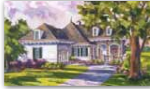
Hall Park II

KENT select A SMARTER WAY TO A LUXURY HOME