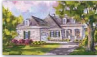
Hall Park I